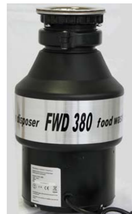
MODEL FWD 380 Air switch system built in