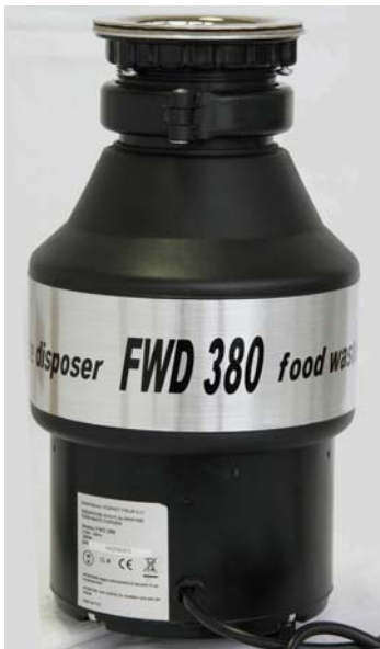
MODEL FWD 380